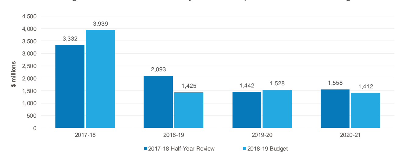
Chart 1.1: Budget result: 2017-18 Half-Yearly Review compared to the 2018-19 Budget

New South Wales is facing a slowdown in transfer duty revenue in the near term. Transfer duty is expected to decline by $565 million in 2017-18 and a total of $5.5 billion across the three years to 2020-21 relative to the 2017-18 Half-Yearly Review. At the same time, New South Wales will continue to be penalised under the current model for GST distribution, with the NSW share to reach a historically low level by 2021-22, at which point NSW is expected to receive only 83 cents out of each dollar of NSW per capita share of the GST.