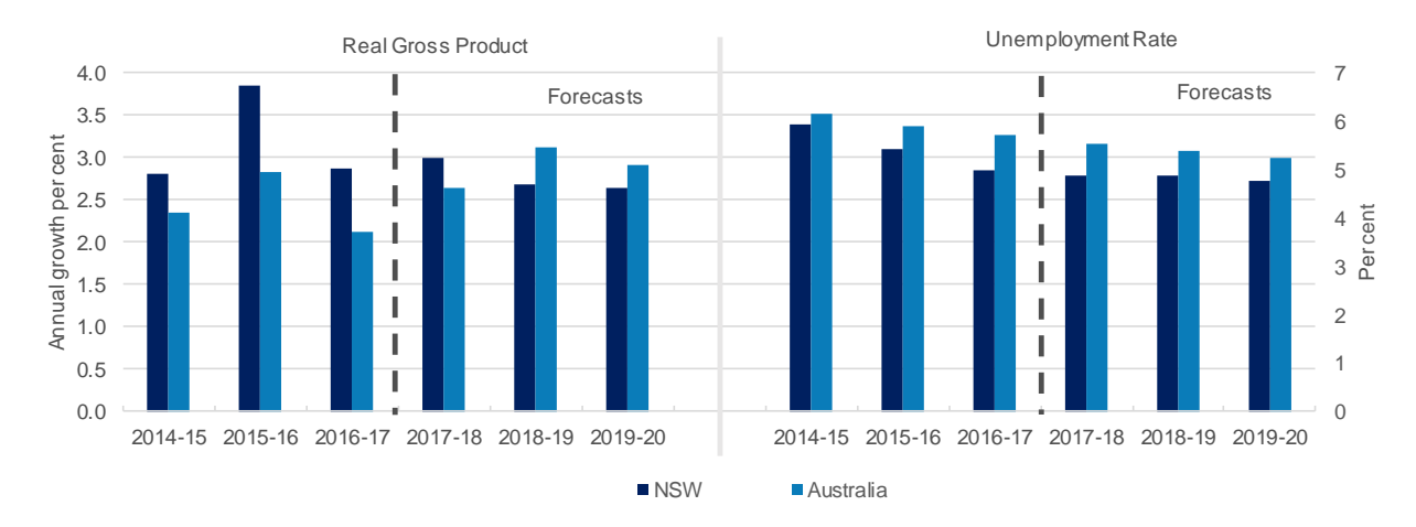
Chart 1.4: NSW maintaining above trend economic activity