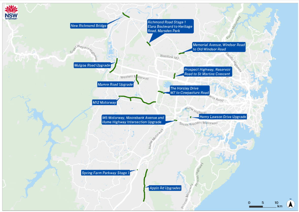
Figure 2.4: Western Sydney Roads Program