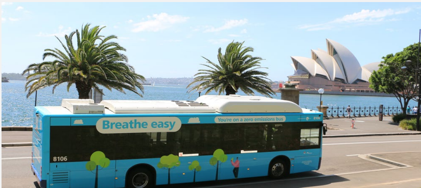
Figure 2.1: Zero Emissions Buses Program

This will help stimulate the local manufacturing and renewable energy industries, support a sustainable and clean economy, as well as progressing Transport for NSW's transition to Zero Emission Buses to meet NSW Government's 2050 Net Zero Emissions target. Outcomes will include a reduction in carbon emissions and pollutants resulting in better health outcomes along with more comfortable journeys for customers and quieter streets. Measurement of the outcomes will be conducted via customer surveys, community feedback, calculations of total emissions removed in Tranche 1, and the successful operation of 12 electric bus depots.