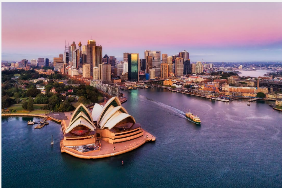
Figure 2.5: Circular Quay Precinct Renewal

Circular Quay is a critical transport interchange in the heart of Sydney, and the only interchange in Australia where ferry, light rail, heavy rail, bus, taxi and active transport converge. It is home to Sydney's busiest ferry hub, one of Sydney's most important train stations and Australia's main overseas cruise ship terminal.