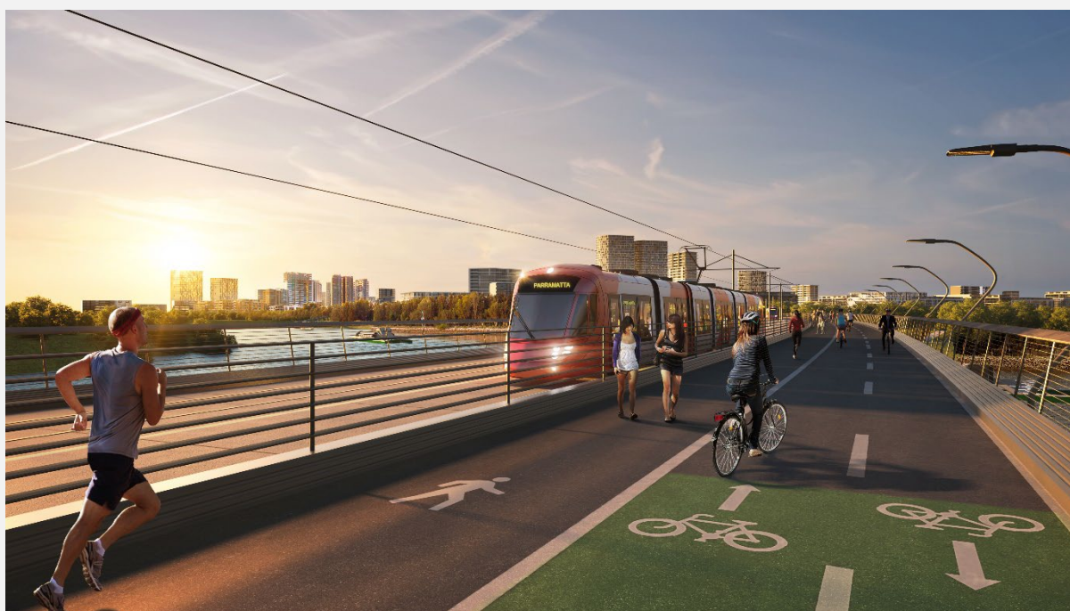
Artist impression of proposed light rail and active transport bridge connecting Wentworth Point and Melrose Park.